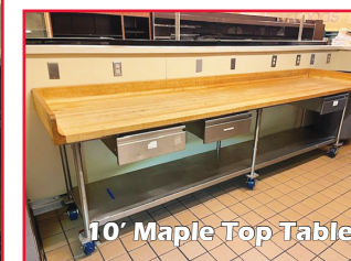
10' Maple Top Table