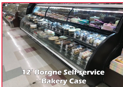
12' Borgne Self-service Bakery Case

BLUE HOSE W/ DISPENSER MISC. METRO CARTS 4'X 5' S.S. HOOD 3'X3' S.S. VENT 10' ROLLING S.S. MAPLE TOP BAKERY TABLE 3 HOLE 2 DRAINBOARD S.S. BAKERY SINK 10' 2 HOLE 2 DRAINBOARD S.S. SINK 1 HOLE 2 DRAINBOARD S.S. SINK 3 GREASE MATS 21' S.S. HOOD W/ANSUL SYSTEM 2 PITCO DOUBLE BASKET DRYERS 6 BURNER WOK STOVE TRAULSEN 10' REFRIGERATED PREP COUNTER 11' S.S. OVERHEAD SHELF 10' S.S. OVERHEAD SHELF 6' S.S. OVERHEAD SHELF 2- ALUM DUNNAGE RACK 7' S.S. TABLE 10' S.S. TABLE 5 INGREDIENTS BINS W/LIDS 4'X 4' S.S. HOOD 2- 8' S.S. SHELF ON WALL 11' COUNTER W/ HAND SINK 6' PREP COUNTER 8' S.S. PREP COUNTER 10' S.S. PREP COUNTER 12' S.S. PREP COUNTER W/ HAND SINK 5' S.S. COUNTER BUNN 2 BURNER COFFEE POT 5 ECO LAMP BUG LIGHTS 6' COUNTER W/ICE MACHINE UNDER COUNTER ORANGE JUICE MACHINE 10'X 3' BAKERY SERVICE COUNTER 6' UPRIGHT BAKERY DISPLAY CASE 10' UPRIGHT BAKERY DISPLAY CASE S.S. MISC. DELI INSERT PANS HOBART ROTISSERIE 4' S.S. HOOD 3 HOLE 2 DRAINBOARD S.S. DELI SINK 8'X4' S.S. HOOD WITH ANSUL SYSTEM 1 HOLE 1 DRAIN BOARD S.S. SINK GREASE FIRE EXTINGUISHER DAYTON FAN PLASTIC WRAP HOLDER