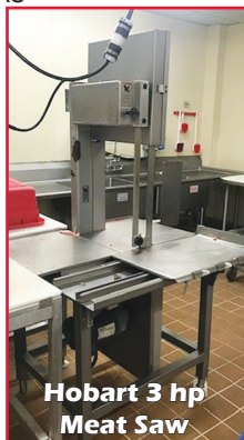
Hobart 3 hp Meat Saw

HOBART 40QT. MIXER W/ATTACHMENTS BKI PRESSURE FRYER ELECTRIC HOBART DOUBLE BASKET FRYER GAS OLIVER BREAD SLICER 3' BEVERAGE COUNTER 6' CURVED GLASS HOT FOOD CASE 8' S.S. COUNTER W/POLY TOPS BLAST CHILLER TRAULSEN SMART CHILL SINGLE GLASSDOOR COOLERS COUNTERTOP WRAPPERS 5' POLY TOP TABLES 10' POLY TOP TABLES 6' S.S. CABINET MUFFIN PANS SHEET PANS BAGUETTE PANS HOBART BAKERY PAN DISHWASHER 6'X 4' ISLAND GLASS BAKERY DISPLAY CASE 5' COUNTERTOP WARMER TAYLOR SOFTECH ICE CREAM MACHINE HOBART HEAT N HOLD CABINET VULCAN 18"X 24" CHAR BOILER GRILL GAS WOLF GAS GRIDDLE W/OVEN VULCAN 6 BURNER STOVE W/OVEN CONVECTION 4 BKI CURVED GLASS HOT FOOD CASE LUCKS DOUGH PRESS ALTO SHAAM HEAT N HOLD CABINET ROTISOL ROTISSERIE OVEN NATURAL GAS 2011 ALTO SHAAM GAS OVEN 5 BAKERY TRANSFER CABINET TAYLOR SLURPEE MACHINE NEMCO MANUAL ONION CUTTER COUNTERTOP NSF COUNTERTOP DELI WRAP 2 HOLE 1 DRAINBOARD S.S. SINK BAXTER DOUBLE RACK OVEN BAXTER DOUBLE RACK PROOFER 2 DOOR HOBART RETARDER 8' ALUM. DUNNAGE RACK 5' TAN METRO 3-5' ALUM. DUNNAGE RACK 2-6' ALUM. DUNNAGE RACK 3' ALUM. DUNNAGE RACK 3-5' ALUM. DUNNAGE RACK 3' TAN DUNNAGE RACK HOBART 3 DOOR RETARDER BOX 4' POT STORAGE RACK ON WALL