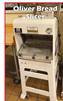
Oliver Bread Slicer