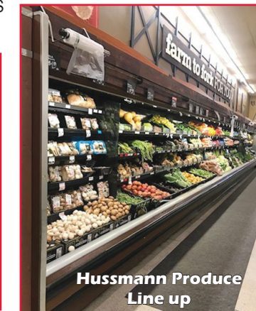
Hussmann Produce Line up

5' SANDWICH PREP TRUE 2 DOOR SOLID FREEZER 3 SOLID DOOR CONTINENTAL COOLER TRUE 2 GLASS DOOR COOLER 2- TRUE 3 DOOR GLASS COOLERS COLD TECH 2 HALF DOOR FREEZER BEVERAGE AIR 3 DOOR UNDERCOUNTER REFRIG. TRUE 3 DOOR UNDERCOUNTER REFRIG. ZERO ZONE 2 DOOR COOLER HILL PHOENIX PRODUCE CASE 2 ICE MERCHANDISER SPOT FREEZERS