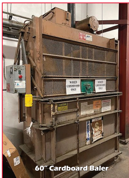
60" Cardboard Baler

8' HUSSMANN SANDWICH PREP 2017 14' HUSSMANN SERVICE DELI 2017 3 DOOR ZERO ZONE COOLER 2011 4' BORGNE SUSHI CASE 2015 24' CURVED CLASS HUSSMANN SERVICE DELI 1997 12' BORGNE SANDWICH PREP 2014 6' 5 DECK HILL-PHOENIX DELI CASE 2008 4' HUSSMANN 5 DECK DELI 1997 2 GLASS DOOR TYLER FREEZER 1997 32' KYSER/WARREN 5 DECK 2011 10 GLASS DOOR HILL FREEZER 2003 28' HILL 5 DECK DELI/DAIRY 2003 3 GLASS DOOR BORGNE FLORAL 8' BORGNE OPEN FRONT FLORAL 3 GLASS DOOR ZERO ZONE COOLER WITH CONDENSING UNIT 2018 2 GLASS DOOR ZERO ZONE COOLER 2011 2 GLASS DOOR ZERO ZONE FREEZER WITH CONDENSING UNIT ELECTRIC DEFROST 2011 PERLICK 3 KEG REFRIGERATOR NSF 4' BORGNE 3 DECK DELI 2019 BORGNE SOUP/SALAD 2008 56' TYLER REAR LOAD DAIRY/DELI 24' TYLER 5 DECK DAIRY/DELI 20 GLASS DOOR ZERO ZONE FREEZER 2013 52' TYLER MULTI DECK 46' KYSOR WARREN GLASS DOOR FREEZER 3 GLASS DOOR HILL FREEZER 2 GLASS DOOR HILL COOLER 2008 2 GLASS DOOR HILL COOLER 2015 4- 16' REFRIG. HILL PRODUCE ISLAND 24' HUSSMANN PRODUCE CASE 48' HUSSMANN PRODUCE CASE 24' HUSSMANN PACKAGE PRODUCE 5 DOOR ZERO ZONE COOLER 12 DOOR ZERO ZONE COOLER 2 GLASS DOOR HILL FREEZER 3 GLASS DOOR HILL FREEZER 19 GLASS DOOR HILL FREEZER BORGNE 3 DECK GRAB N GO COOLER 4' HUSSMANN 5 DECK DELI