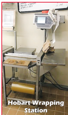
Hobart Wrapping Station

BLUE HOSE W/ DISPENSER MISC. METRO CARTS 4'X 5' S.S. HOOD 3'X3' S.S. VENT 10' ROLLING S.S. MAPLE TOP BAKERY TABLE 3 HOLE 2 DRAINBOARD S.S. BAKERY SINK 10' 2 HOLE 2 DRAINBOARD S.S. SINK 1 HOLE 2 DRAINBOARD S.S. SINK 3 GREASE MATS 21' S.S. HOOD W/ANSUL SYSTEM 2 PITCO DOUBLE BASKET DRYERS 6 BURNER WOK STOVE TRAULSEN 10' REFRIGERATED PREP COUNTER 11' S.S. OVERHEAD SHELF 10' S.S. OVERHEAD SHELF 6' S.S. OVERHEAD SHELF 2- ALUM DUNNAGE RACK 7' S.S. TABLE 10' S.S. TABLE 5 INGREDIENTS BINS W/LIDS 4'X 4' S.S. HOOD 2- 8' S.S. SHELF ON WALL 11' COUNTER W/ HAND SINK 6' PREP COUNTER 8' S.S. PREP COUNTER 10' S.S. PREP COUNTER 12' S.S. PREP COUNTER W/ HAND SINK 5' S.S. COUNTER BUNN 2 BURNER COFFEE POT 5 ECO LAMP BUG LIGHTS 6' COUNTER W/ICE MACHINE UNDER COUNTER ORANGE JUICE MACHINE 10'X 3' BAKERY SERVICE COUNTER 6' UPRIGHT BAKERY DISPLAY CASE 10' UPRIGHT BAKERY DISPLAY CASE S.S. MISC. DELI INSERT PANS HOBART ROTISSERIE 4' S.S. HOOD 3 HOLE 2 DRAINBOARD S.S. DELI SINK 8'X4' S.S. HOOD WITH ANSUL SYSTEM 1 HOLE 1 DRAIN BOARD S.S. SINK GREASE FIRE EXTINGUISHER DAYTON FAN PLASTIC WRAP HOLDER