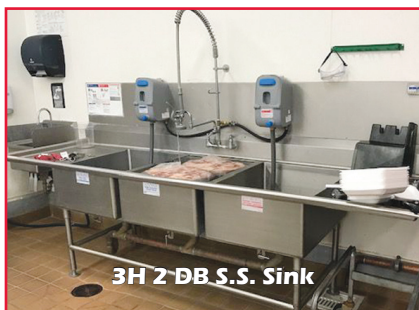
3H 2 DB S.S. Sink