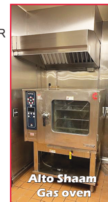
Alto Shaam Gas oven

ONAN GENERATOR W/ TRANSFER SWITCH 2- CONVEYERS 2- DAYTON OVERHEAD FANS 48" MAREN CARDBOARD BALER GREEN STEP LADDER EMPLOYEE LOCKERS GRAY INVENTORY CART GRAY STEP LADDER 4' BLUE 4 DECK STOCK CART 2 EYE WASH STATION TLC INDUSTRIES 60" BALER KILKOM 60" BALER 4 MAILBOXES (LOCK BOXES) 5 - 5' ALUM. STORAGE RACK 2' METRO RACK 4' METRO RACK 2 - 6' ALUM. STORAGE RACKS ECO LAB HOSE W/WASHING STATION 2 STEP LADDER BIG JOE PALLET JACK FORKLIFT 4' GREEN METRO RACK 2- 6' TAN METRO RACK 2- 5' GREEN METRO ON WHEELS 2- 4 STEP STOCKING GREEN LADDER 2- 5' ALUM. DUNNAGE RACKS GRAY INVENTORY CART 4 - STEP LADDER 2- ALUM. 2 DECK STOCKING CART 4- 5' PLASTIC DUNNAGE RACKS TAN 2- 5' PLASTIC DUNNAGE RACKS RED 6 WHEEL CART